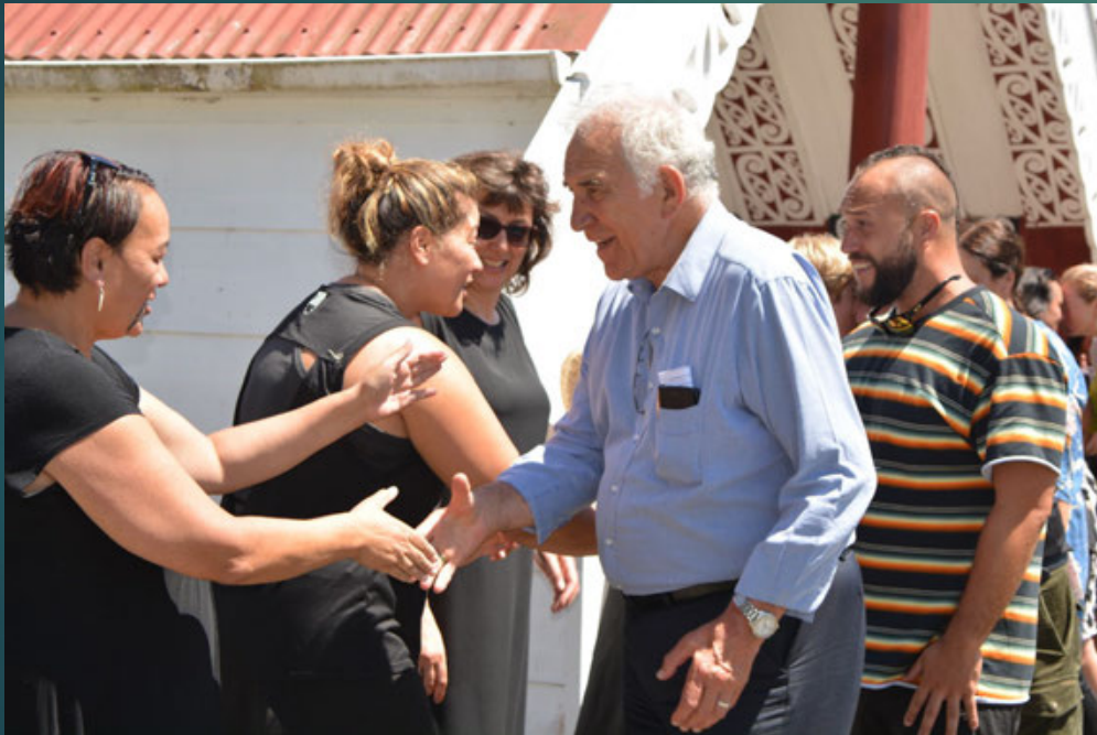
Hosting PI Wanganga Ngā Pae at Ranana