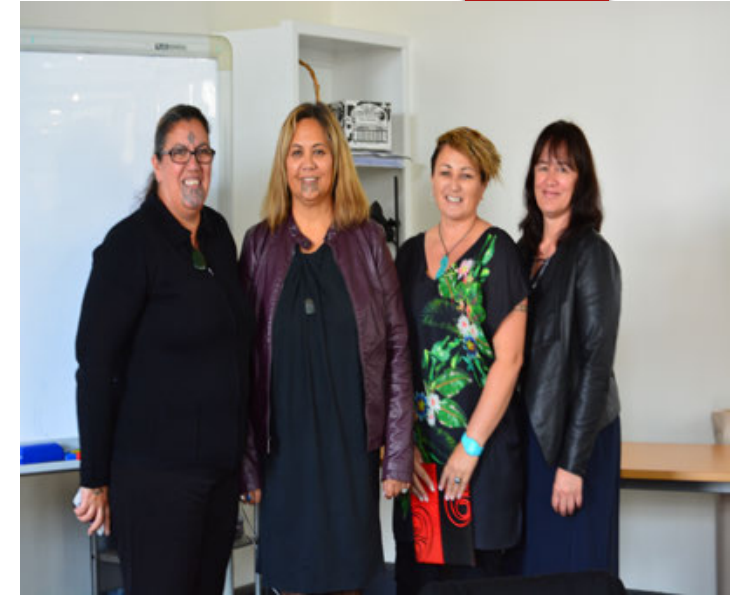
Poipoia te Mokopuna 2016