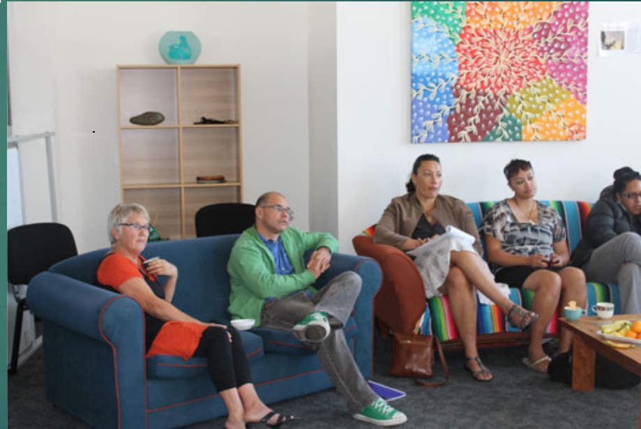
Te Atawhai o te Ao