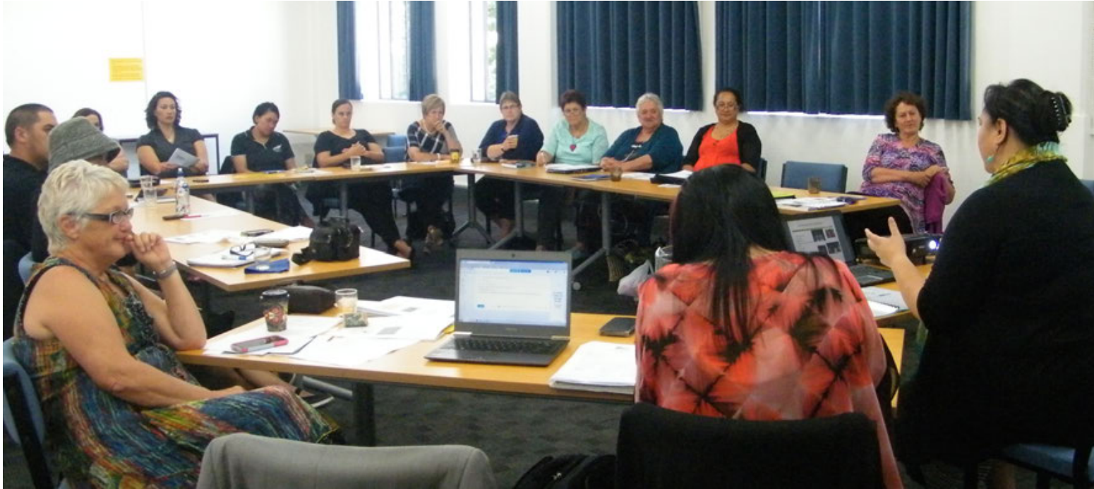
Kua Hiki te Kohu 2015